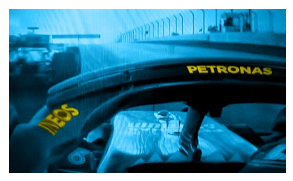
Formula 1 racing attracts fossil fuel company sponsors.