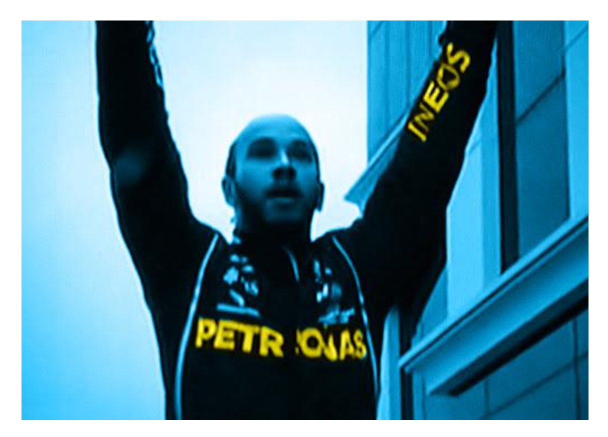
Fossil fuel companies Ineos and Petronas sponsor Formula 1 racing.

Overall we found more than 250 sponsorship deals involving high carbon industries (see Appendix 2). <sup>14</sup> In first position are car manufacturers with 199 sponsorship deals. Airlines comes second place with 63 sports sponsorships. Other high carbon companies listed are fossil fuel companies, such as the Russian giant Gazprom and British-owned multinational chemical companies Ineos, BP and other companies invested in fossil fuel extraction and product derivatives. Toyota and Emirates are the two largest sponsors according to our survey, with deals secured in most sports categories. Other high-carbon companies listed include some airports, a multinational travel agency and a cruise ship company.