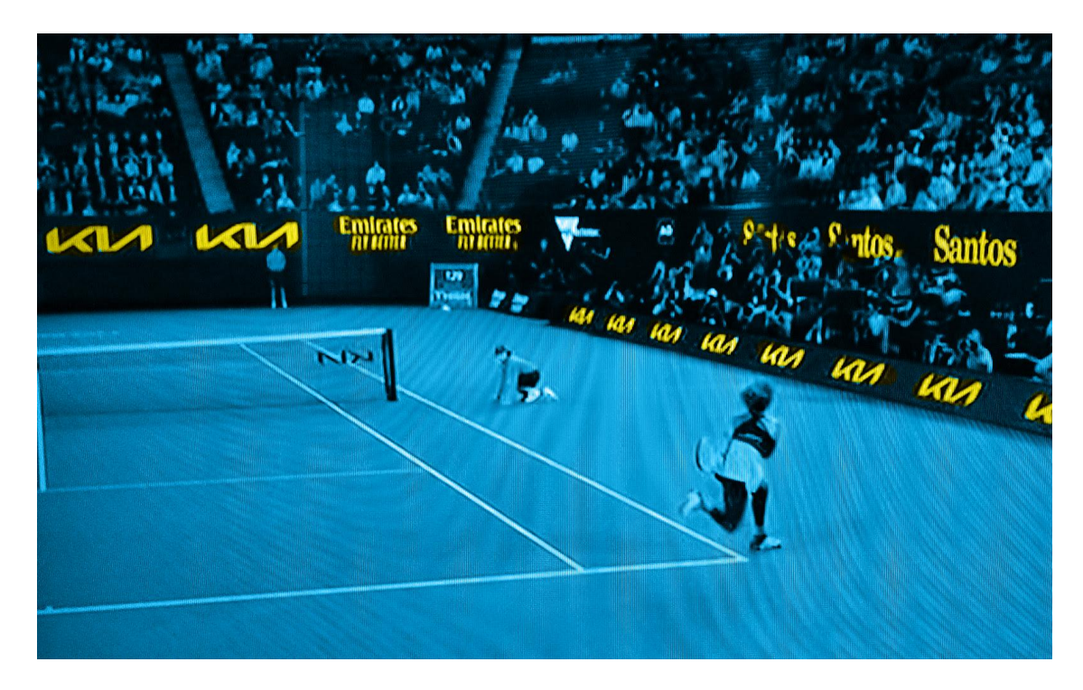
The 2021 Australian Tennis Open was sponsored by an oil and gas company, an airline and a car maker.

The car industry is a significant player in the field of sports sponsorships with an approximate $1.285 billion spent on general sports and an estimated 64% of car companies' sponsorship budget dedicated to sports, in comparison with spending on other sectors. Football clubs in particular are often targeted by car companies via ownership or sponsorship deals. When it comes to airlines' sports sponsorship, Middle East airlines especially have positioned themselves as a leader in the global market. Among them, the UAE-based airline Emirates comes top of the list, having signed countless partnerships with football, tennis, rugby, sailing, horse racing and golf clubs around the world.